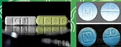
LEFT Real Xanax